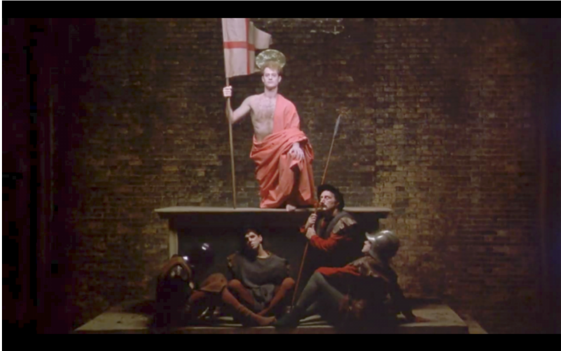
Derek Jarman, War Requiem (1989).