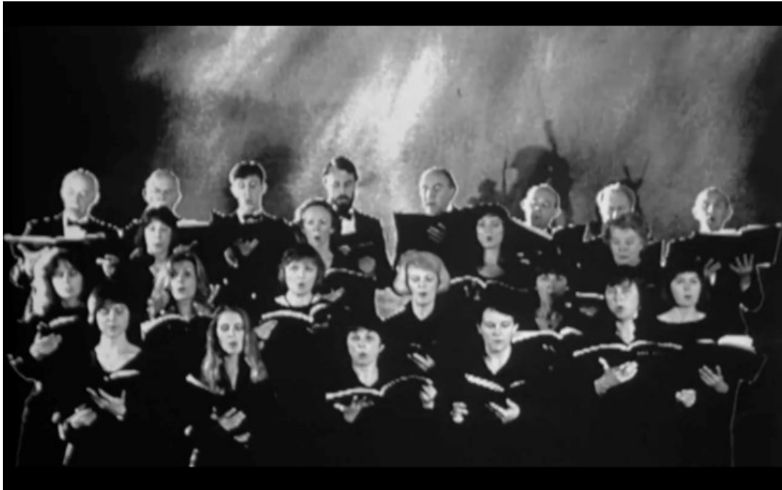
© Derek Jarman, War Requiem (1989).