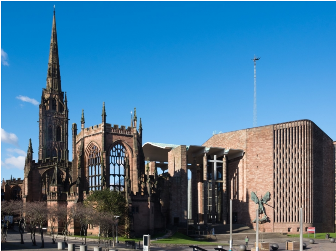
Illustration 1. Basil Spence’s reconstruction of Coventry Cathedral (1962).

who had taken part in the 1944 Normandy landings and committed suicide in 1959. 1 Basil Spence’s reconstruction of Coventry Cathedral is striking for the way in which it preserves the former cathedral’s ruined shell alongside the modern design [See Illustration 1].