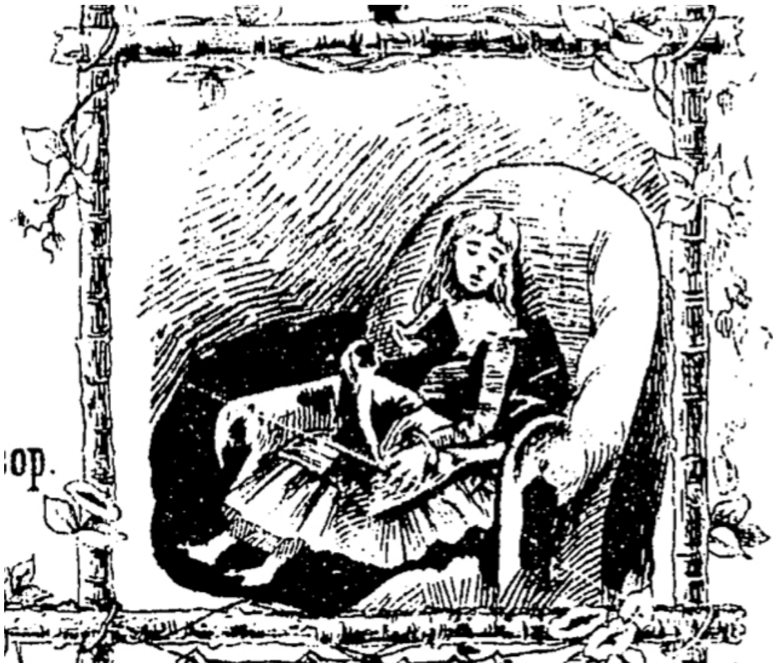
Figure 3. Detail of Scènes enfantines title page by Théodore Lack

22 Returning to the cover page illustration with this ending in mind, we can now interpret the positioning of Yvonne's body as the posture of a sleeping child, eyes closed, head tilted slightly to the left, having succumbed to the soothing effects of her own lullaby play. With this final in-score text, Lack has shifted the piece significantly, yet almost imperceptibly, from a depiction of a child at play to one of a child at sleep. Yvonne had been exercising her creative agency over an inanimate plaything, but when she herself falls asleep, she becomes powerless, an inanimate plaything of an adult, who has placed her in the passive and static position of a doll. To what extent did the music ever truly express the voice of the child? Or does it rather ventriloquize the child in order to give voice to the hidden adult's aetnormative perspective on childhood?