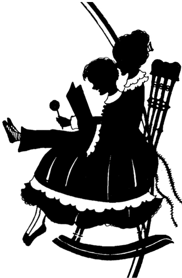
Figure 6. Detail of Four Duets for Two Beginners title page by Mrs. Crosby Adams