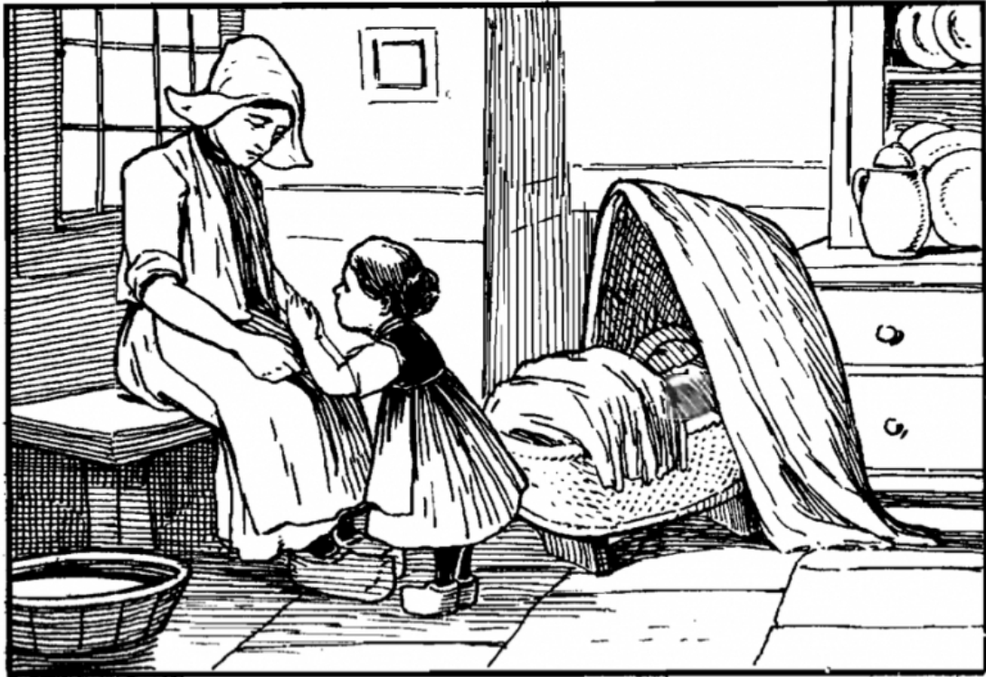
Figure 5. Illustration from “The Dutch Mother’s Goodnight: Lullaby” from Holland Suite by Florence Newell Barbour

27 Each piece in Barbour’s collection included framed, ink-drawn illustrations at the top-left corner, and the picture for “Lullaby” is remarkable for depicting the complexity of the mother-child dyad in the domestic sphere, rather than adhering to sentimentalized idealizations. We see a simple domestic interior, a kitchen, judging by the dish cabinet to the right (see Figure 5), with a woven basket to the right, potentially containing folded linens. A mother sits on a low bench beneath a window, wearing a Dutch cap with turned up wings, a white apron, and wooden clog shoes. Before her is a young girl, a toddler wearing her own set of small clogs and white apron, her face turned towards the mother and away from a pillow-filled cradle. Mothering children is work, sometimes emotionally rewarding, but also emotionally and physically exhausting, a concept communicated by the mother’s worn expression combined with her rolled-up sleeves. Furthermore, mothering children is only a part of the maintenance of the domestic sphere, demonstrated in the kitchen’s double function as both nursery and laundry room. Lastly, the picture