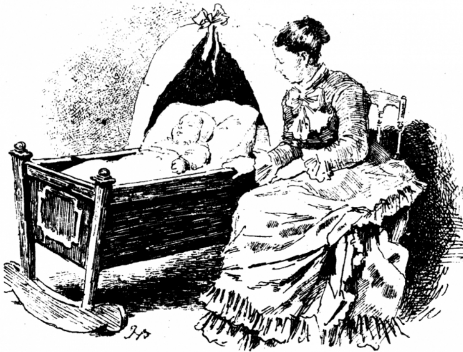
Figure 1. Illustration by Charles Henri Pille for “Berceuse” in Vingt pièces enfantines by Francis Thomé

12 The use of illustrations provided imaginary children’s music with additional visual interest and invested them with a more vivid mirror of prospective social states. Each piece of Vingt pièces enfantines [Twenty children’s pieces] op. 58 (ca. 1883) by French composer Francis Thomé (1850-1909) are headed with half-page pen illustrations by renown French artist Charles Henri Pille (1844-1897) “Berceuse” [Lullaby], the seventh piece in the collection, features a depiction of a grown woman in a voluminous dress sitting in a chair beside a large, wooden bassinet with a half cover. (See Figure 1). A somnolent baby, lips parted and eyes closed, lays within the cradle, their head propped slightly by a large white pillow and a blanket tucked snugly around their torso. Looking down at the child, the woman’s right hand grasps the side of the bassinet and her mouth is slightly open, suggesting that she is in the midst of both rocking and singing. This visual depiction of correct maternal care is reflected and augmented in the music, which emphasizes quiet dynamics; a rhythmically simple melody marked “very well sung” [ben cantato], and an accom-