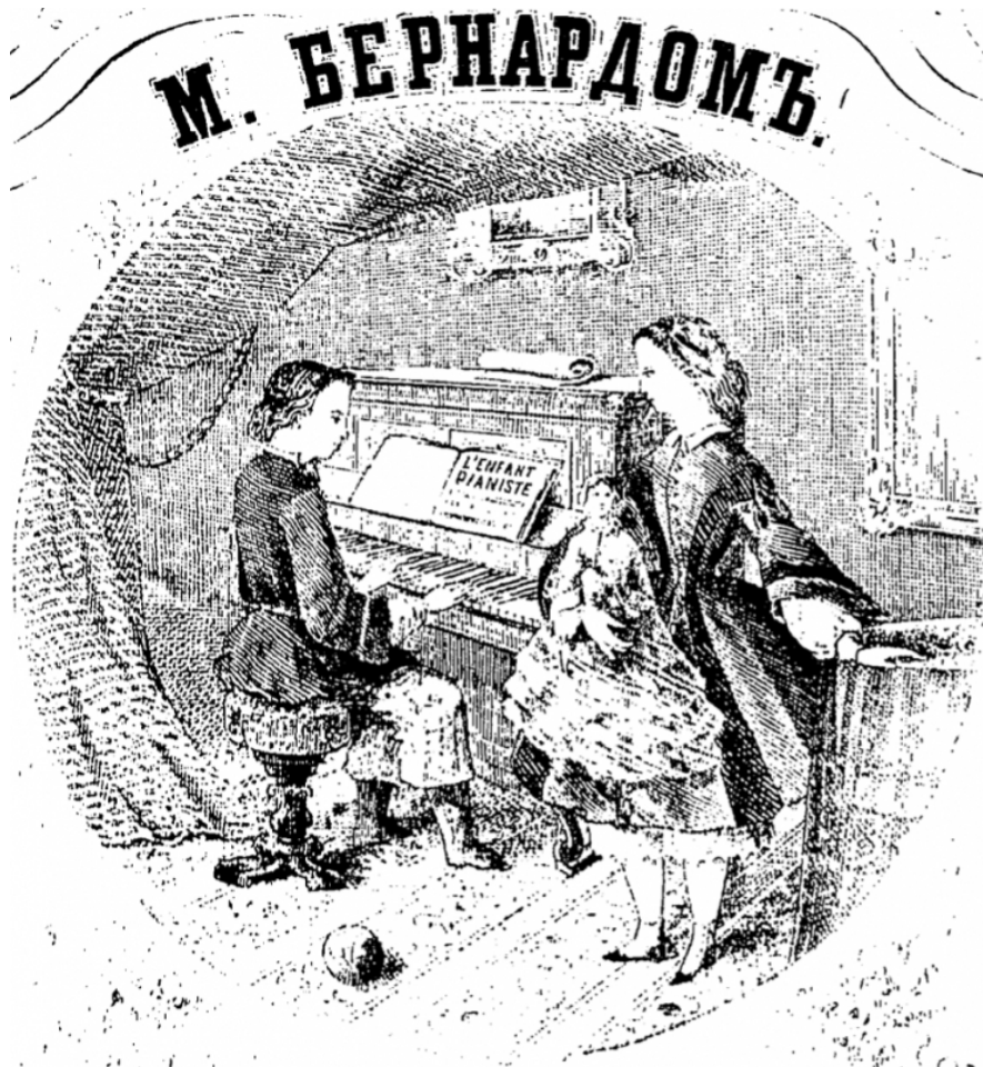
Figure 2. Illustration by unknown artist for L'enfant pianiste by Matvei Ivanovich Bernard