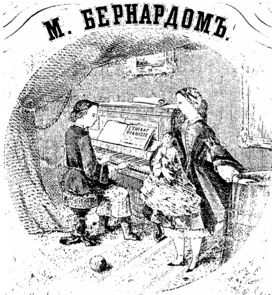
Figure 2. Illustration by unknown artist for L'enfant pianiste by Matvei Ivanovich Bernard