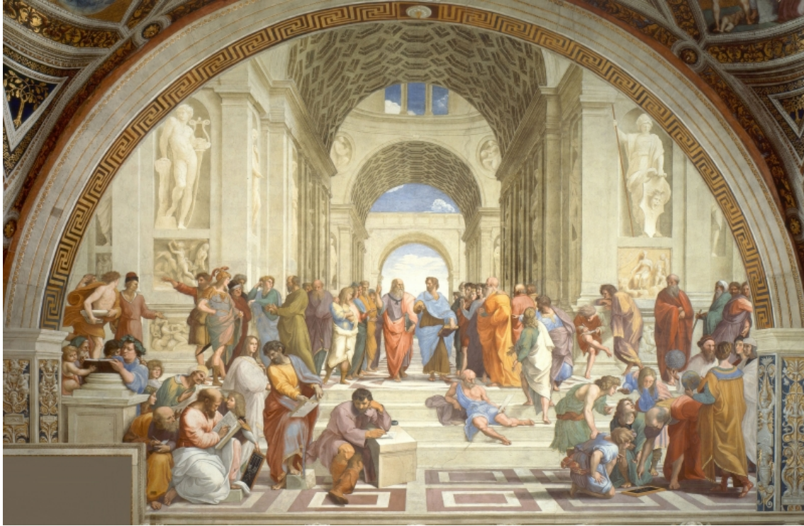
Figure 2. Raphael, The School of Athens , fresco, 1509-1511, Rome, Vatican Palace.