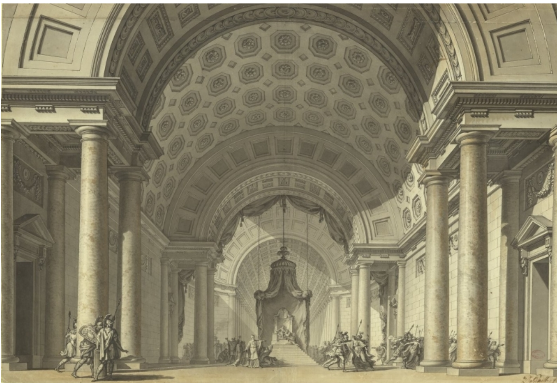
Bibliothèque nationale de France.