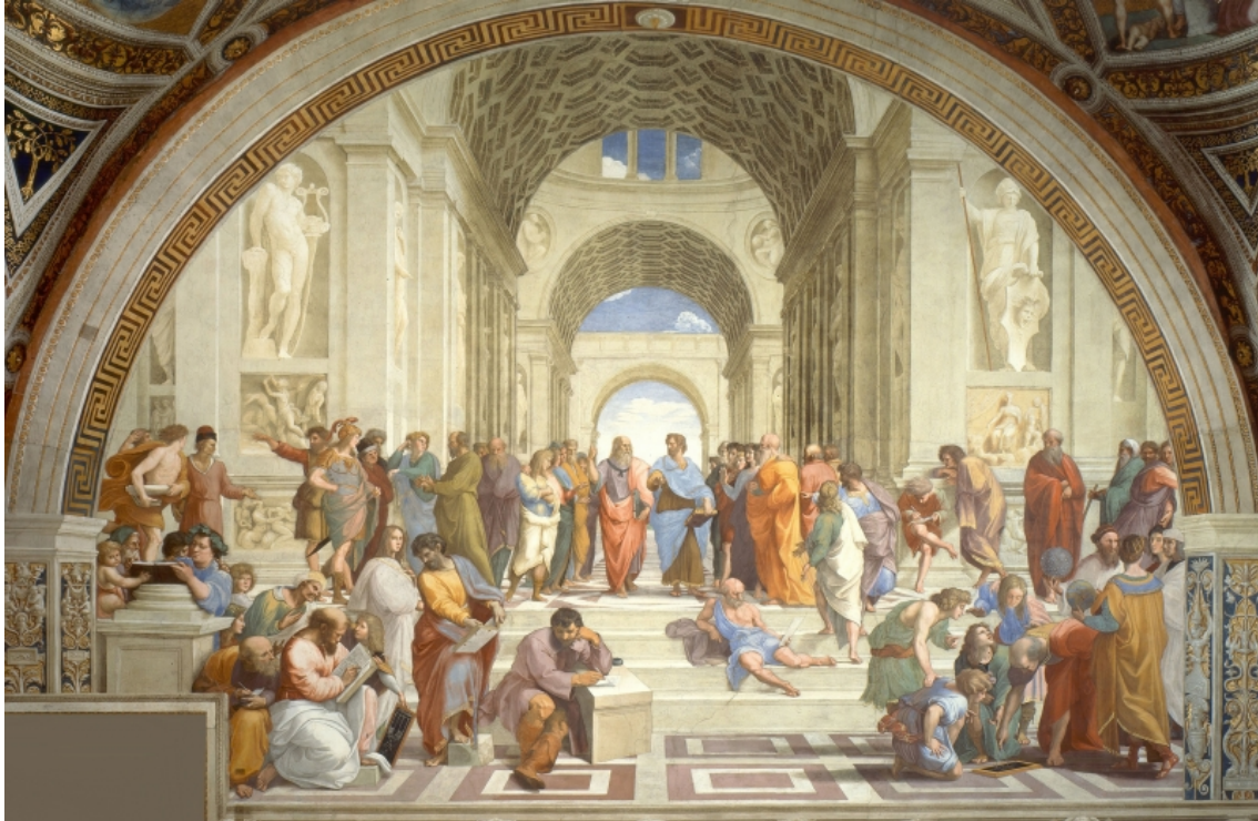
Figure 2. Raphael, The School of Athens , fresco, 1509-1511, Rome, Vatican Palace.