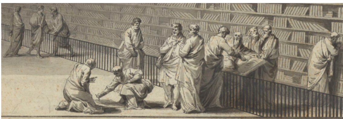
Figure 3. Étienne-Louis Boullée, detail from Fig. 1 (right foreground).