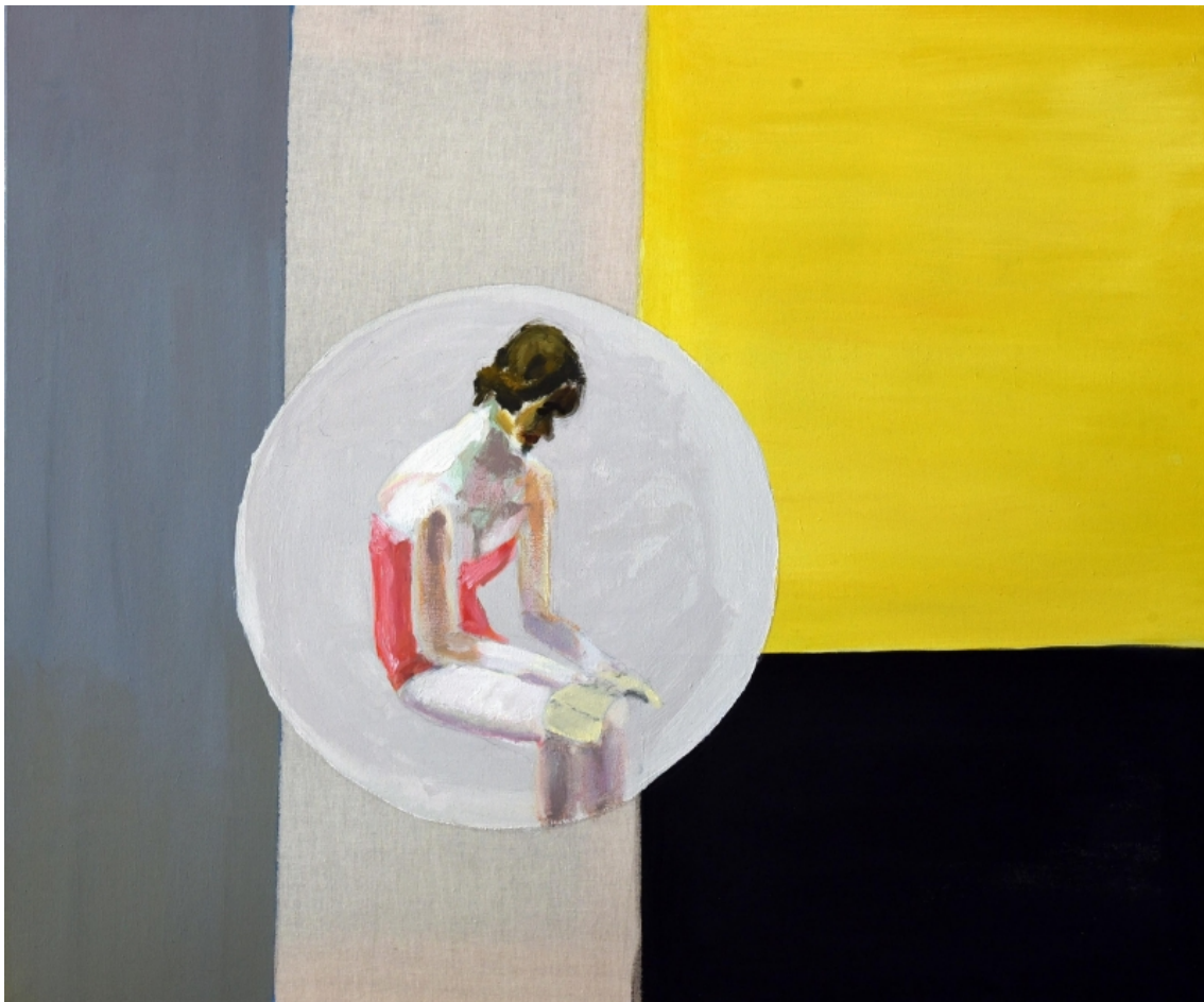
Figure 1. Phelan, Hotel Room Revisted (acrylic on canvas, 2017)